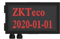
LPR-Display Screen (Optional)