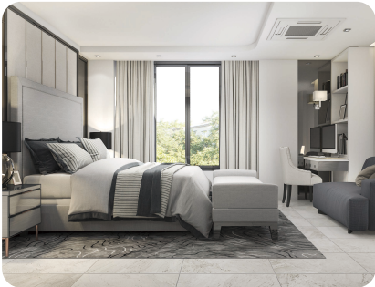
Short-term Rental Units